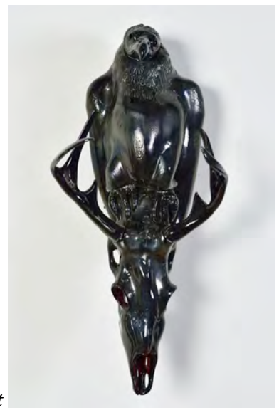
Once To Dust